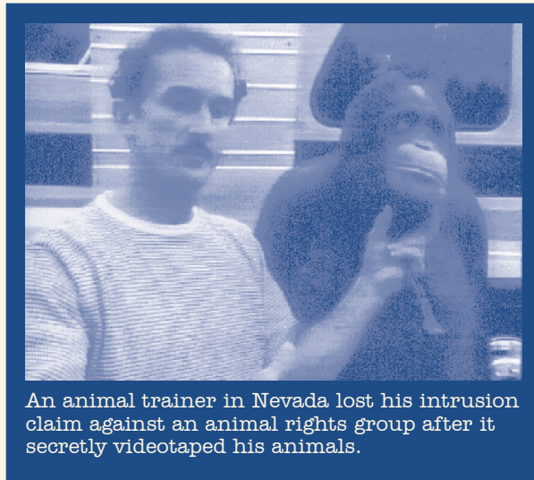
An animal trainer in Nevada lost his intrusion claim against an animal rights group after it secretly videotaped his animals.

Private Facts: The Montana Supreme Court recognized that the state constitution provides an exception to the "public's right to know" that extends to natural human beings but not corporations. Great Falls Tribune v. Montana Public Service Com'n , 82 P.3d 876 (Mont. 2003).