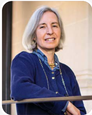
MARTHA MINOW 300th Anniversary University Professor Harvard University