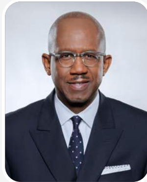
PIERRE G. THOMAS Chief Justice Correspondent ABC News